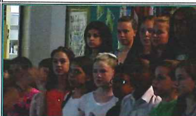
4th and 5th Grade Chorus