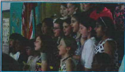
3rd Grade Chorus