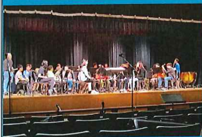
7th and 8th Grade Band