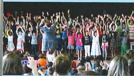
2nd Grade Chorus performs at Nassau in-school concert