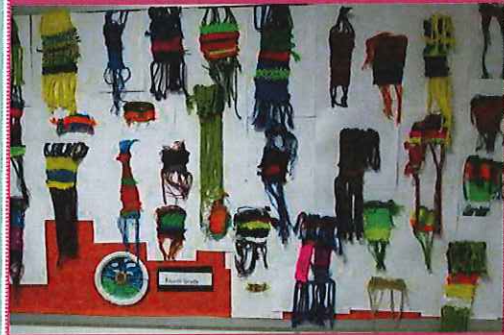
4th grade weaving