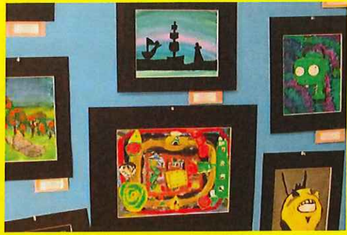
selection of works