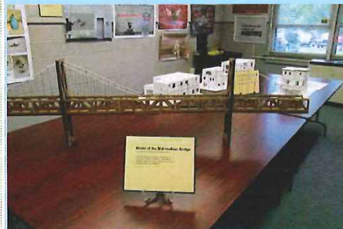
model of Mid-Hudson Bridge by architecture students