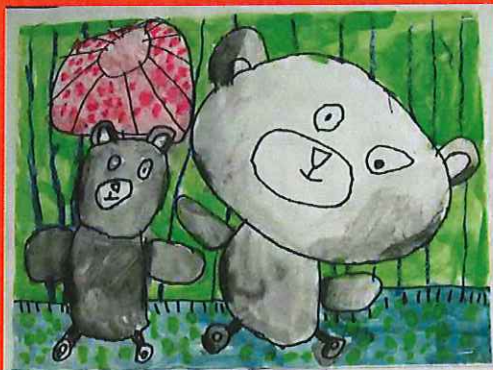
"Bears Are Playing"