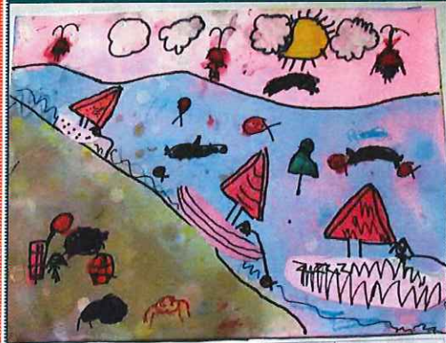
"Day at the Beach"