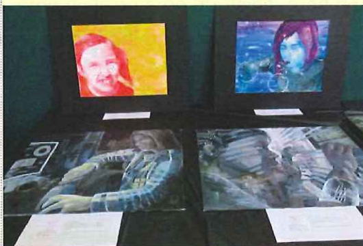
works from Studio in Art