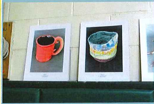
images of ceramics