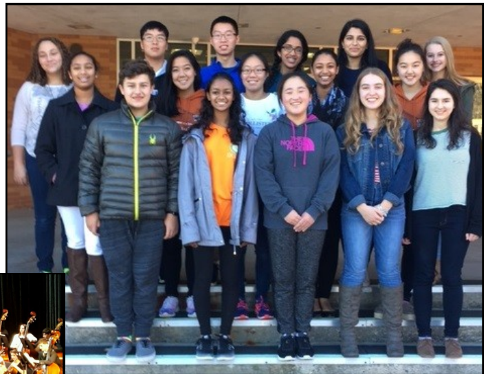
Area All-State 2016 performance