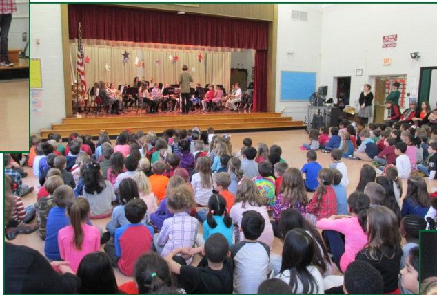
Left: Hagan band, chorus, and strings students visited Nassau's in-school concert to perform several selections.