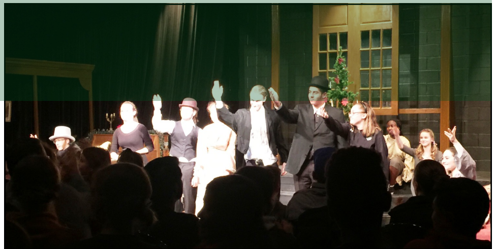
Cast members from A Doll's House take a final bow, above.