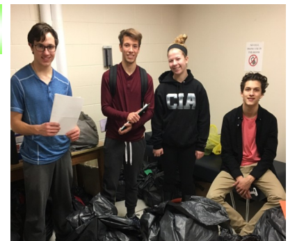
Above: LEO Club students prepare holiday donations for district families. Left Inset: Adopt-a-Family tree in the Hagan lobby.