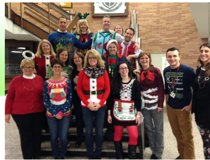
Left: LEO Club members and district staff gather to celebrate accomplishments in helping others in 2016.

with necessities like coats and boots as well as many fun gifts. The Town of Poughkeepsie PBA supported the efforts with boxes of food, while our nurses and social workers went above and beyond and worked quickly to determine the needs of our families. LEO Club and the PBA were recently mentioned in an article in the Southern Dutchess News as well as on Hudson Valley News Network. Please click this link to read the story or visit https://goo.gl/WdWtPj