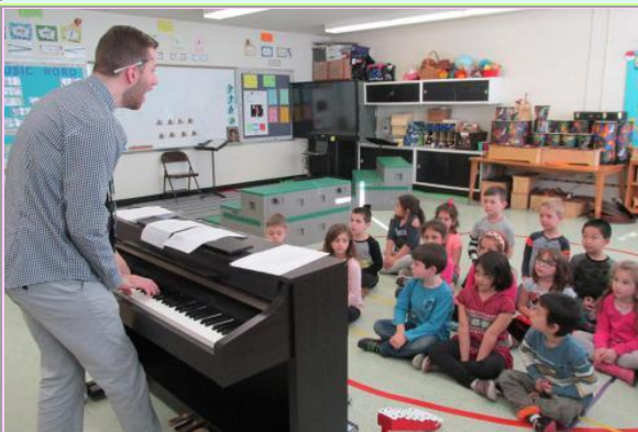
Singing with their teacher