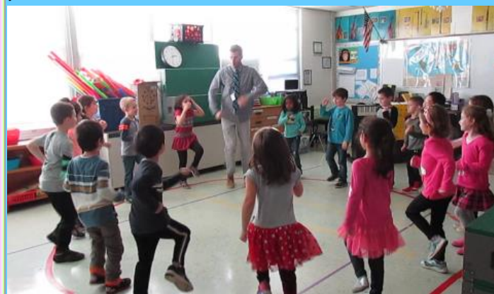
Moving to Peer Gynt