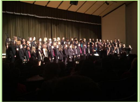
Seventh and eighth grade chorus sings out.