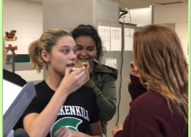
Students enjoy samples.