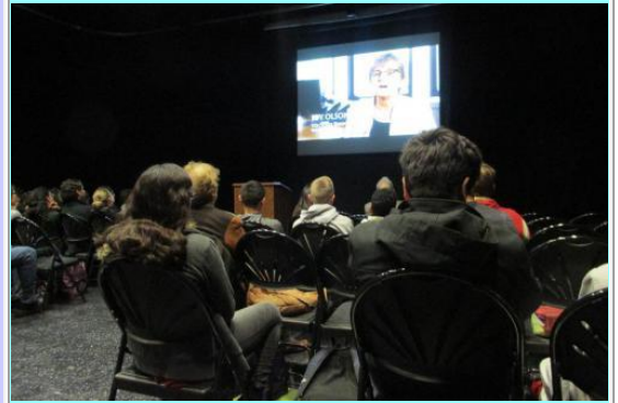
Students and staff watch a short film on Latin America.