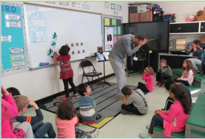
Guessing which note combinations a student is going to choose--no peeking!