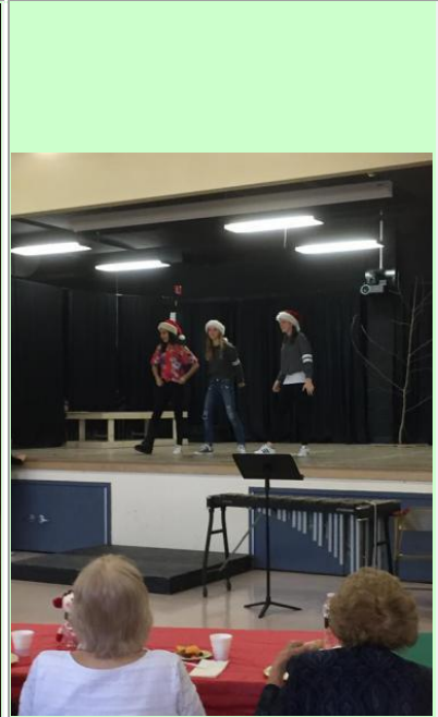
Students entertain the group.