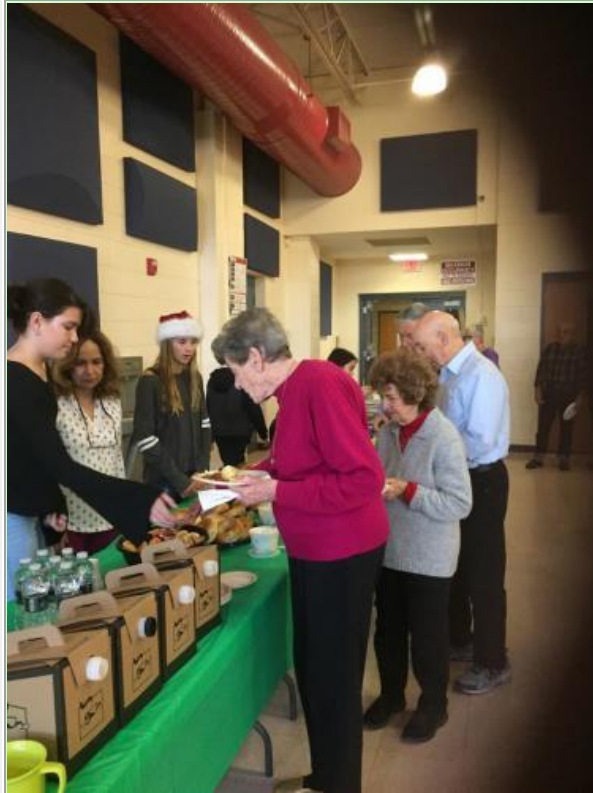
Student Government serves breakfast.