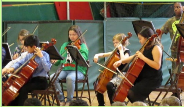
Gold Strings entertains the students