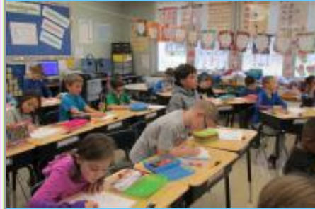
Working on a Kwanzaa kinara