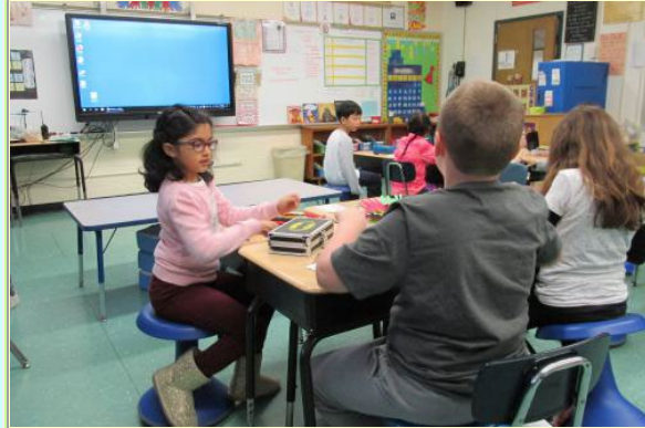
Learning about the legend of La Befana, the Italian gift giver