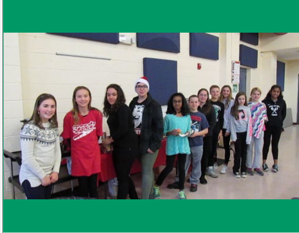
GSA hosts a holiday party.

Middle school GSA hosted a cookie-and-cocoa holiday get-together after school this past Monday. Members of Peer Mediation also joined the festivities with advisers.