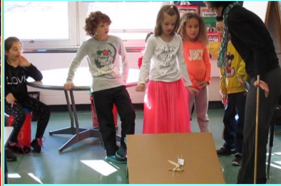
Watching sleigh glide down ramp