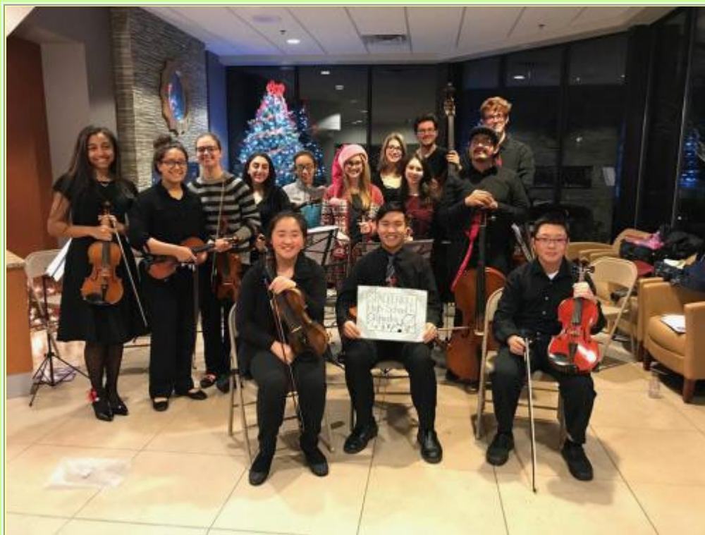
Orchestra students entertained Fishkill Allsport patrons with holiday music.