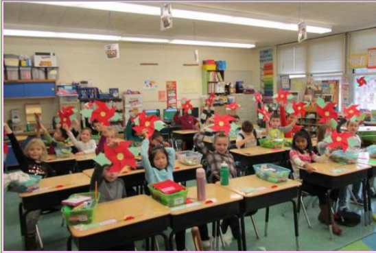
Showing off La Posada craft