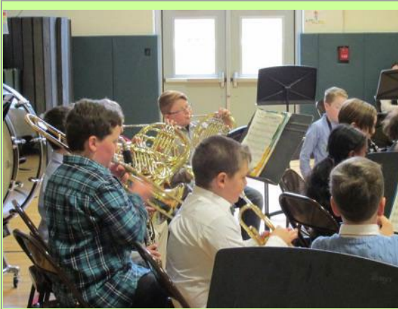
Concert band plays at Nassau