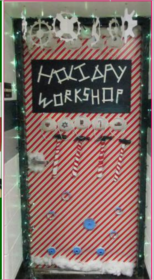
Tech is the winner for the Holiday Workshop Door.