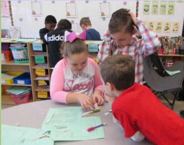
Tweaking the design

students brainstormed ways that they might alter the designs to make them travel even farther!