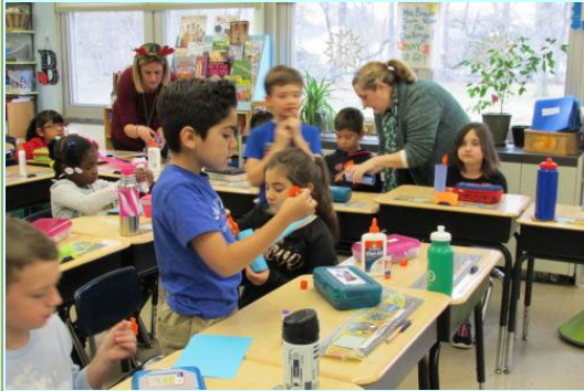
Exploring Hanukkah traditions