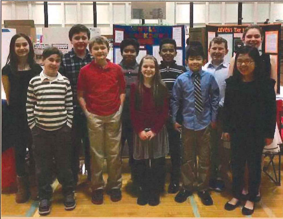
At Hagan, proud science fair participants pictured from left to right are as follows: