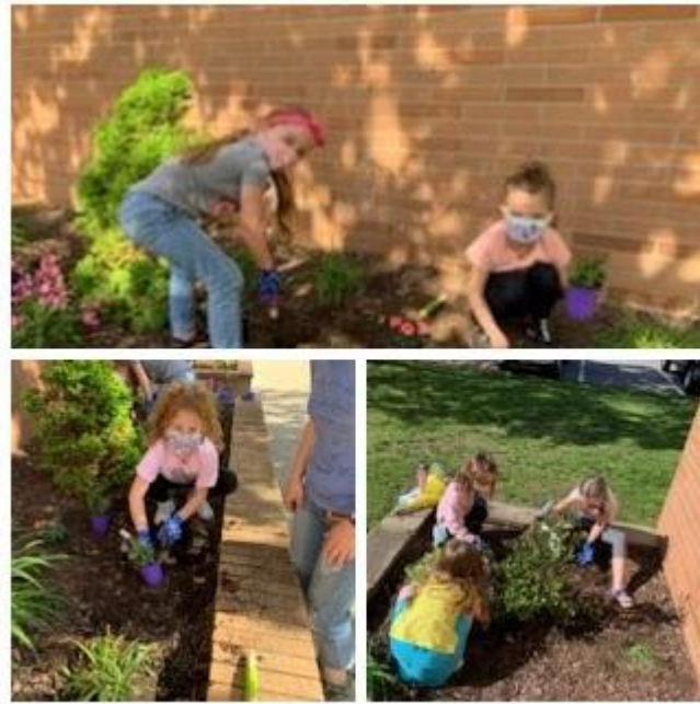
Above: Members of Daisy Troop plant their Nassau garden.

Thank you to Spackenkill Girl Scout Daisy Troop for creating a beautiful garden in the front of Nassau School. The garden looks so nice that it will be incorporated into the end-of-year second grade moving up ceremony. Each second grader will paint a rock to place in the garden on the last day of school as parents and students recognize them on their final walk!