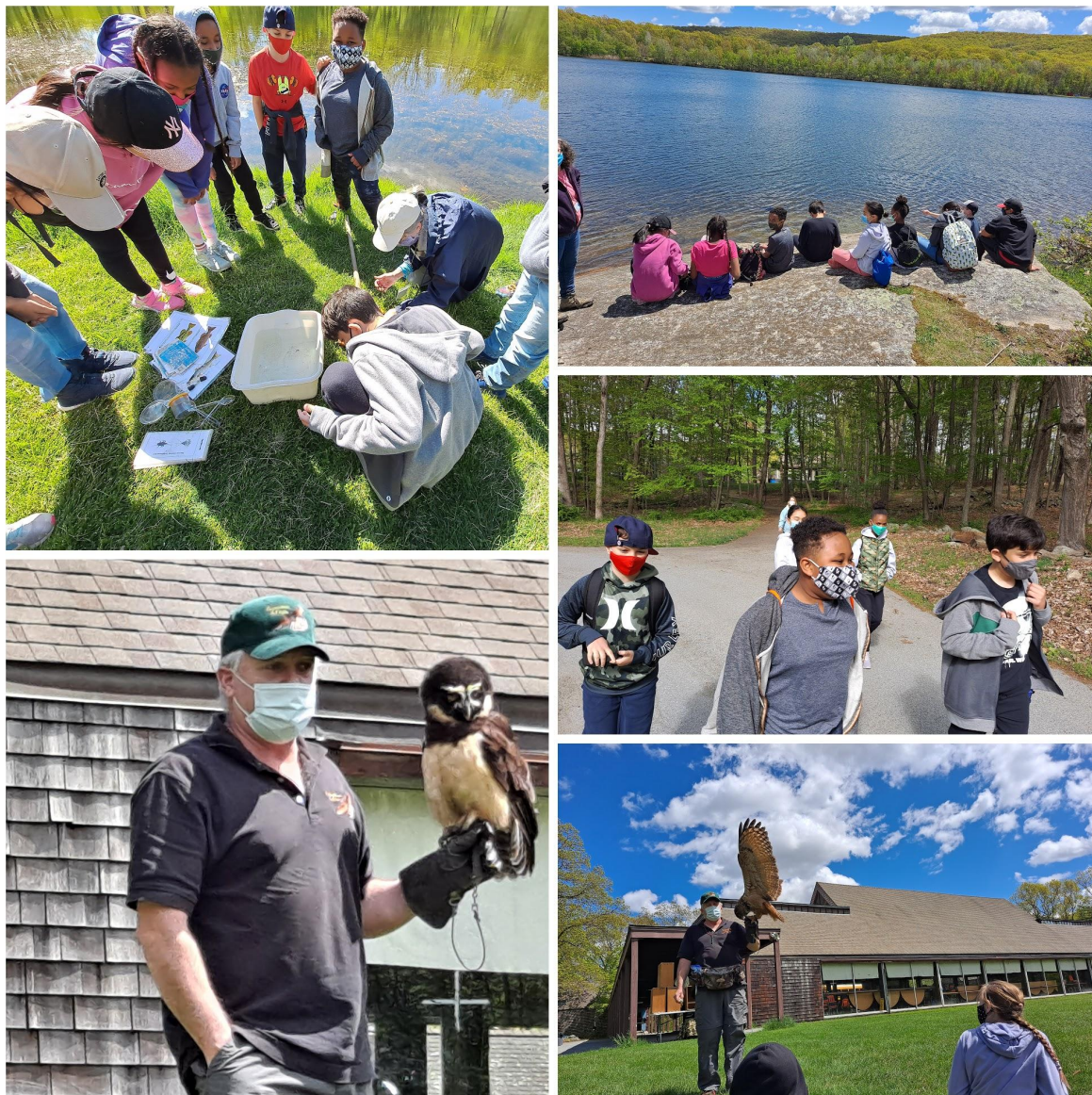
Above: Scenes from Sharpe include a pond study and birds of prey presentation.

This week, fifth grade students once again enjoyed a memory-filled day at Sharpe Reservation, where they explored the outdoors in the company of their peers. Pond studies, hikes, and even a birds of prey presentation were part of this experience, which took place under sunny skies.