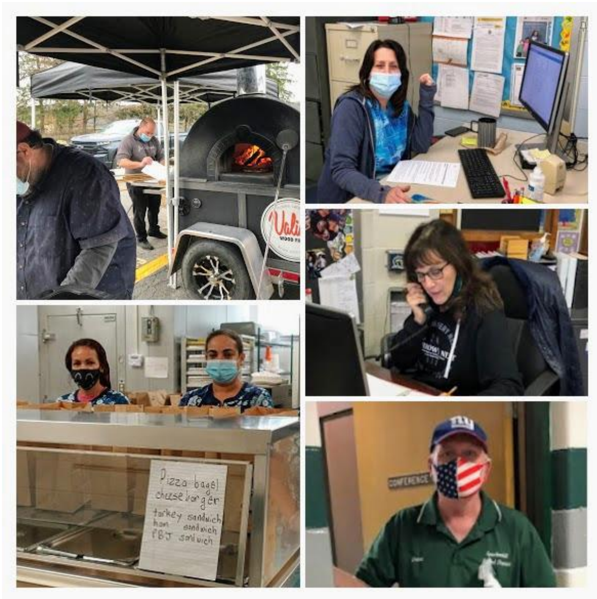
Above: We simply couldn't function as a district without our SRPs, whether nurses, food service workers, secretaries, or custodians. The top left photo shows a food truck that visited the schools this week to provide lunch for SRPs.