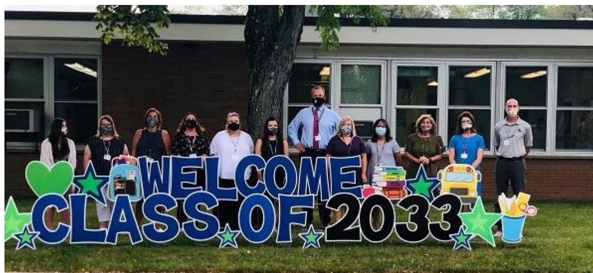
Elementary PTA and Staff welcome kindergartners at orientation.