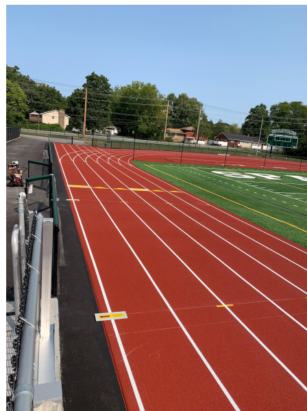
Capital Project update, clockwise from top left: Aerial view of the track, which recently got multiple coats of rubber coating. Site crew sprays on a coating layer. Track lines are the finishing touch. New ADA-accessible playground at Nassau.