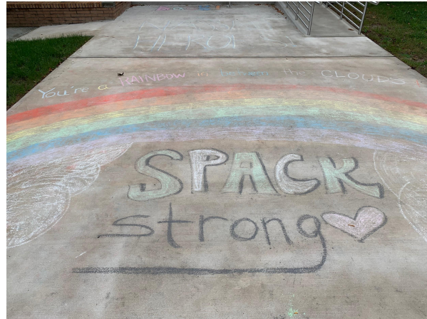
Buses await Hagan third grade students returning home from orientation. Notice the chalk drawings courtesy of the PTA.