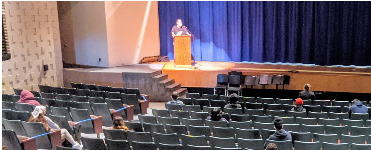
Above: High school music students attend a socially distanced talk.