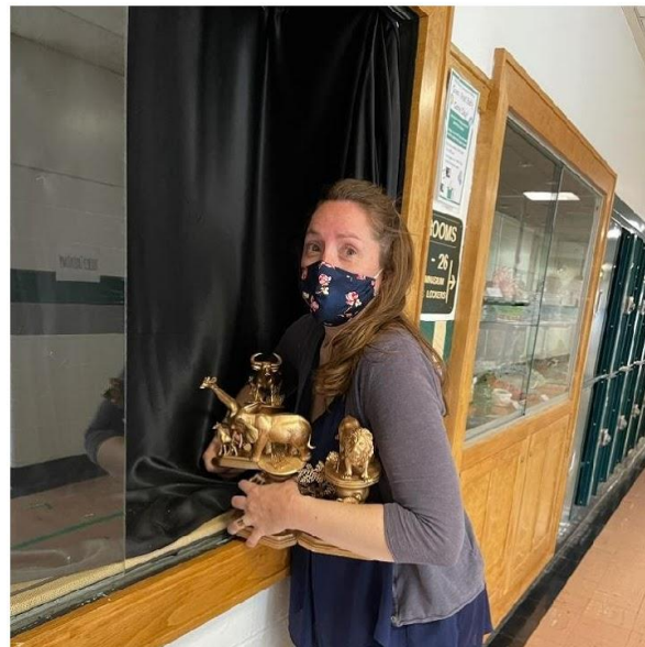
Clockwise from top: Mammal Madness trophies on display in showcase in Todd