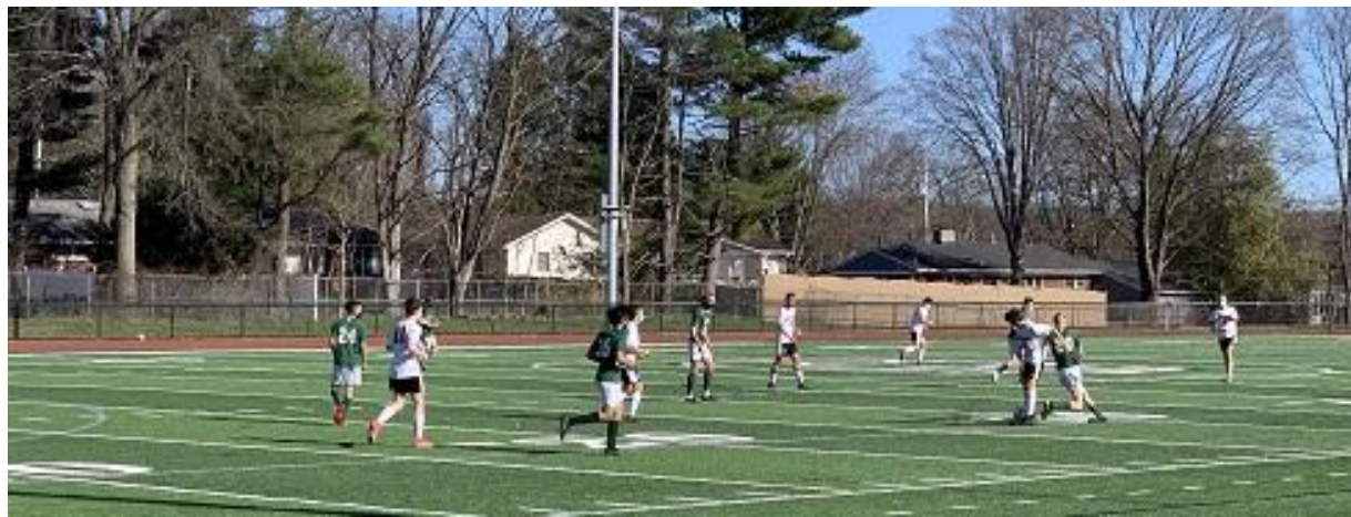
Above: Varsity Boys Soccer played Onteora on Wednesday, winning 4-0.