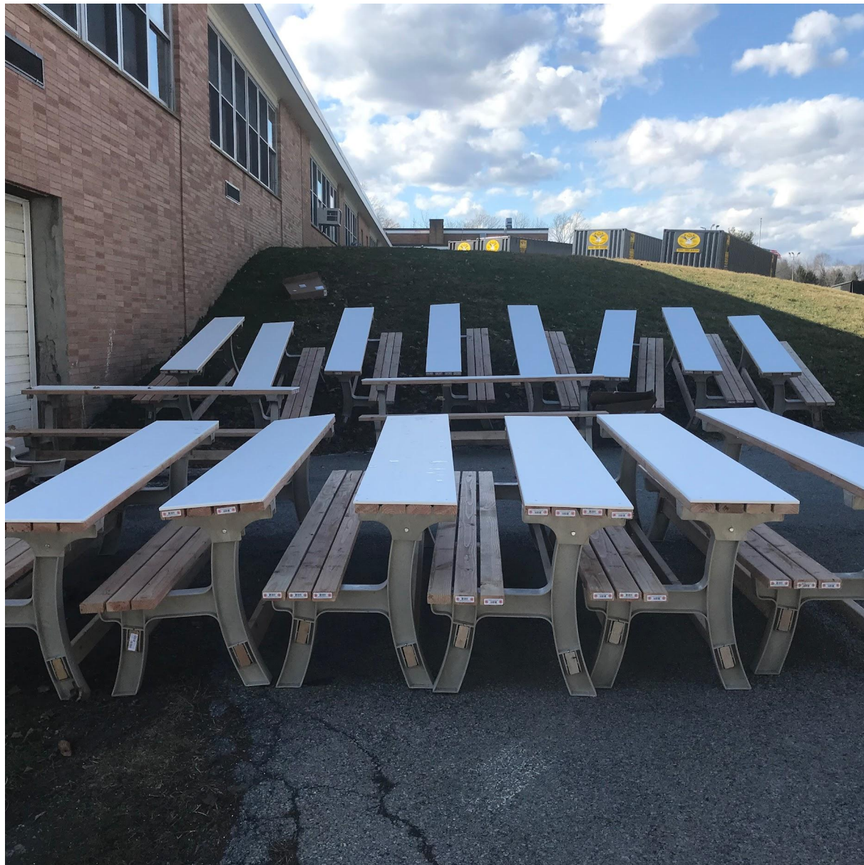
Above: A batch of newly constructed benches just delivered to Hagan.

Now that we're back from break, it's time to move forward with learning. For the elementary schools, outdoor classrooms are coming to life, with plenty of seating for all grades at Hagan and Nassau. These outdoor learning environments not only ensure social distancing and healthy ventilation, but they also offer a refreshing change of spring scenery for students.