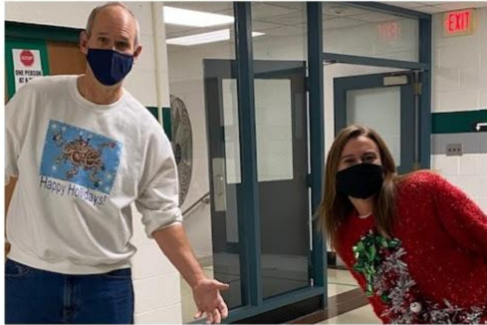
Above: SGO's Spirit Week at SHS brought out a lot of flannel and ugly sweaters, both in person and remotely.

The SGO also concluded its Dutchess Outreach Collection on December 4 and delivered food and personal hygiene items on December 16. As a district we collected over 600 items. SGO would like to thank everyone who donated to such a worthy cause.