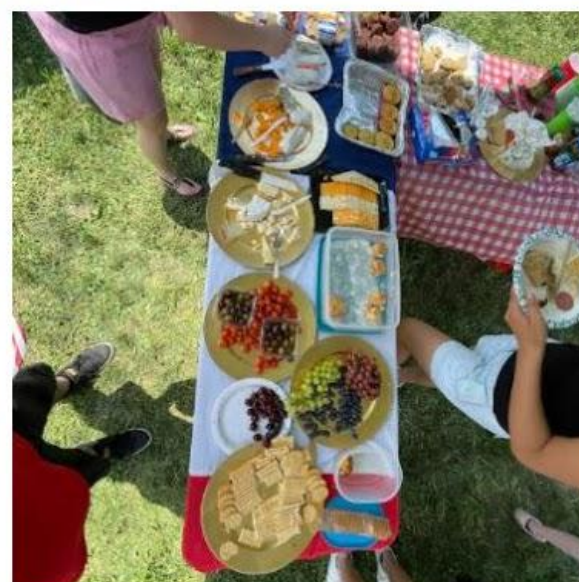
Above: Scenes from a world languages feast.