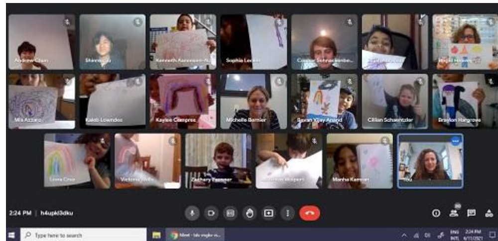
Above: Remote KinderFrench lessons in progress.

On the last day of school for high school students (Monday, June 21), the French Club, in conjunction with the upper-level Spanish classes, hosted a combined picnic on the high school soccer fields. The French side of things, "Pique-nique et pétanque," highlighted traditional French foods (cheeses, charcuterie, cornichons, baguettes, etc.) and a lawn game called pétanque. The Spanish side of things, "Jamón y jai alai," highlighted traditional Spanish foods (jamón serrano, cheeses, olives, roasted red peppers, etc.) and a version of the sport jai alai. Every attending student brought a dish to share, and it really was a feast! It was a wonderful end to the school year that brought the foreign language students together as one group.