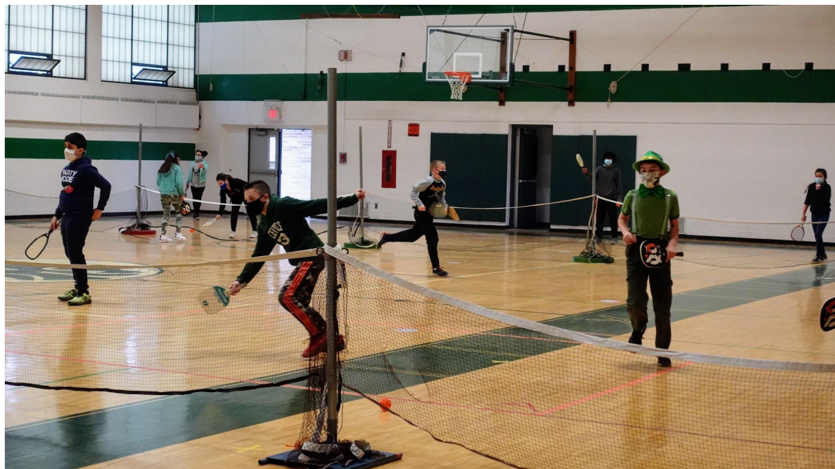
Above: Sixth graders enjoy PE.