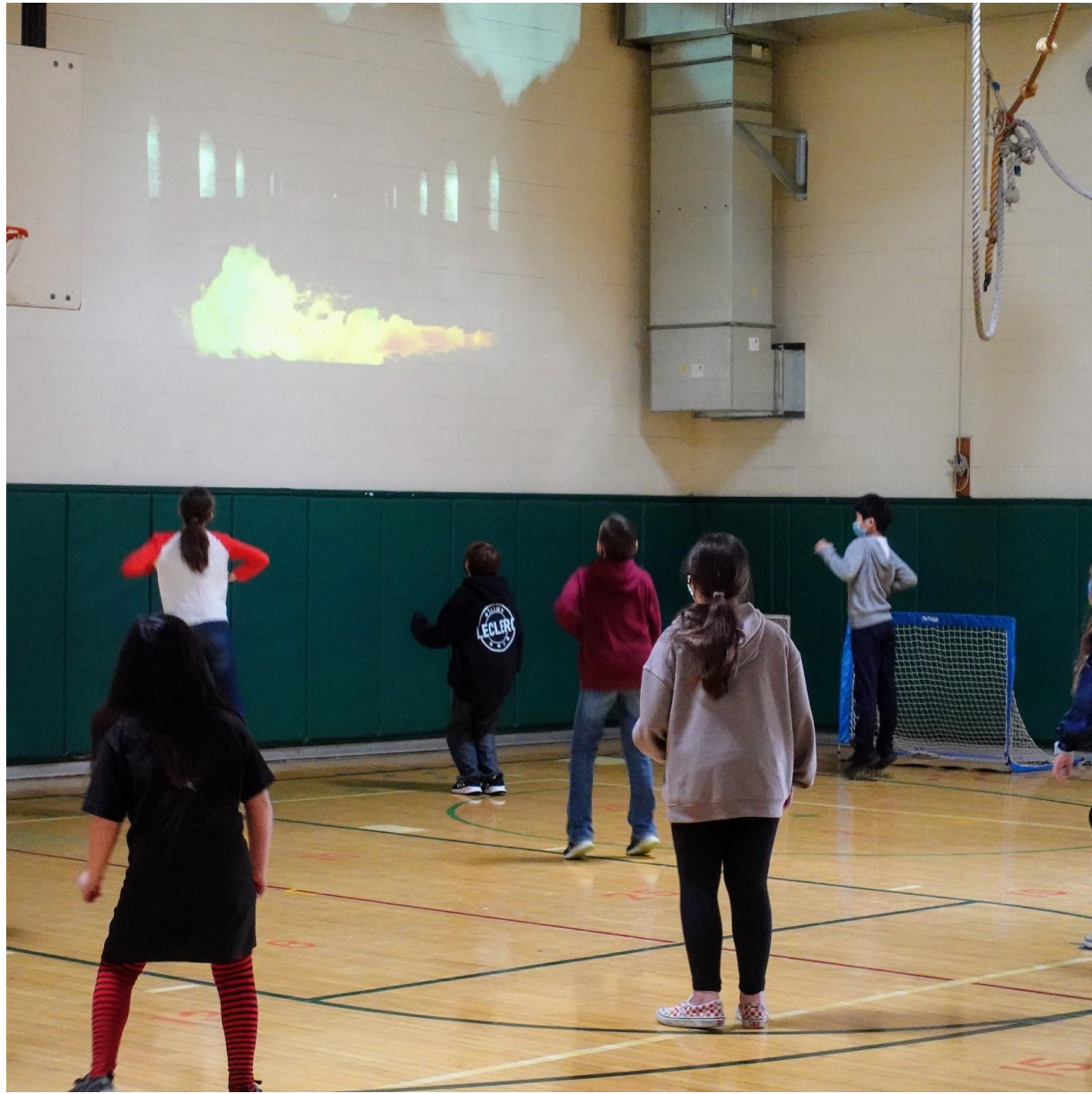
Above: For their PE class this week, fifth graders played Castle Chase, a virtual fitness game (projected on gym wall) in which participants have to dodge knights, avoid fire, and find and use a shield. Students jumped, “flew,” and ran in place to complete the activity.