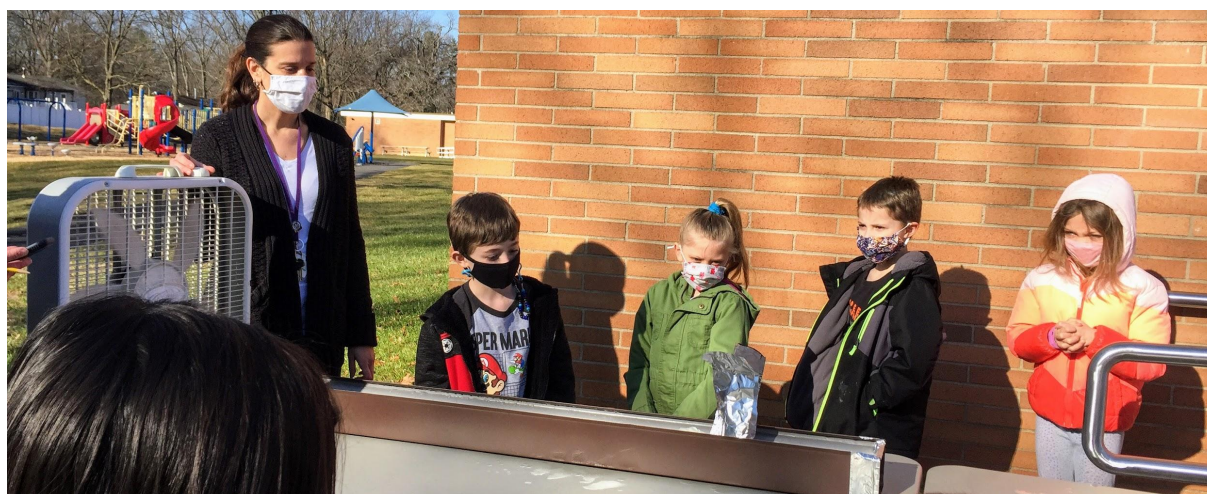
Above: Students used engineering skills to create boats that could float and travel as quickly as possible without capsizing.

Mrs. Wilcox's and Mrs. Zanca's classes collaborated on a science experiment outdoors. The students were challenged to build their version of the Mayflower using simple materials (straw, aluminum foil, Styrofoam plate, and tape) and create a boat that could sail in a water-filled gutter. Most boats sailed in under 10 seconds. The fastest boat made the journey in 4.79 seconds!