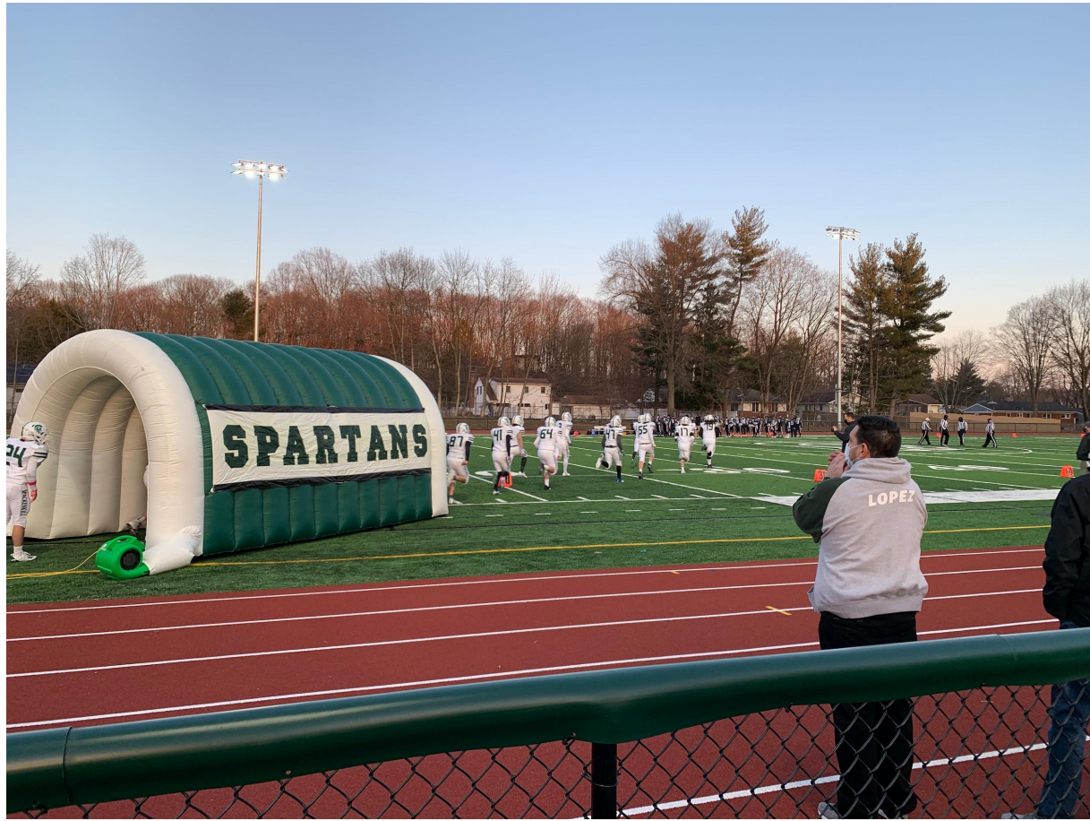
Above: Football players ran from the arch onto the field.