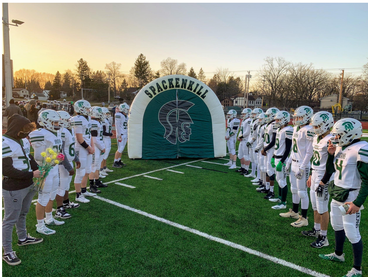
Above: Athletes lined up outside of the Spackenkil arch awaiting seniors to come through with their parents.

The team fell short losing to Pine Plains 20-18, but it was still a special night for the program and our community. We look forward to many more nights like this in the future and opening the gates to everyone.