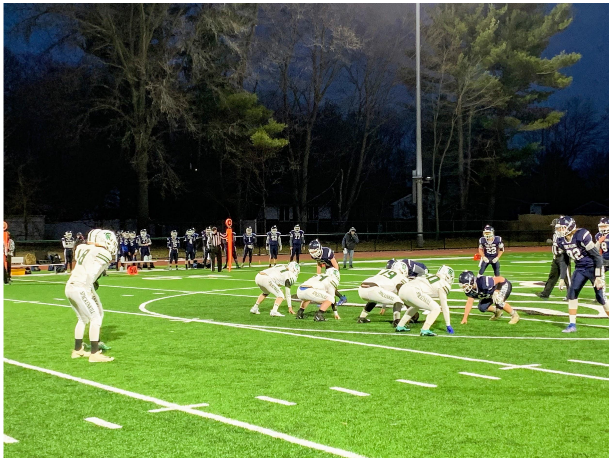
Above: A scene from Spackenkill's first football game of the season, which was played under the lights.