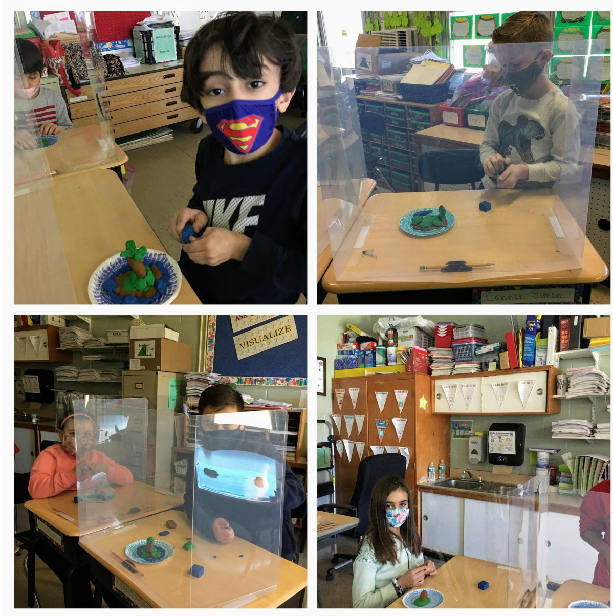
Above: Mrs. Strapec's second graders created individual clay islands.

Mrs. Strapec's second graders have been learning about land forms. The students then used clay to design an island. It was fun to see their individual takes on the activity.