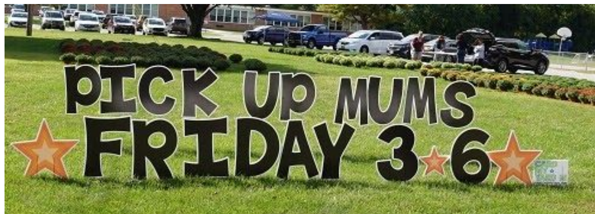
Above: Volunteers for the Elementary PTA distribute mums at a fall fundraiser.