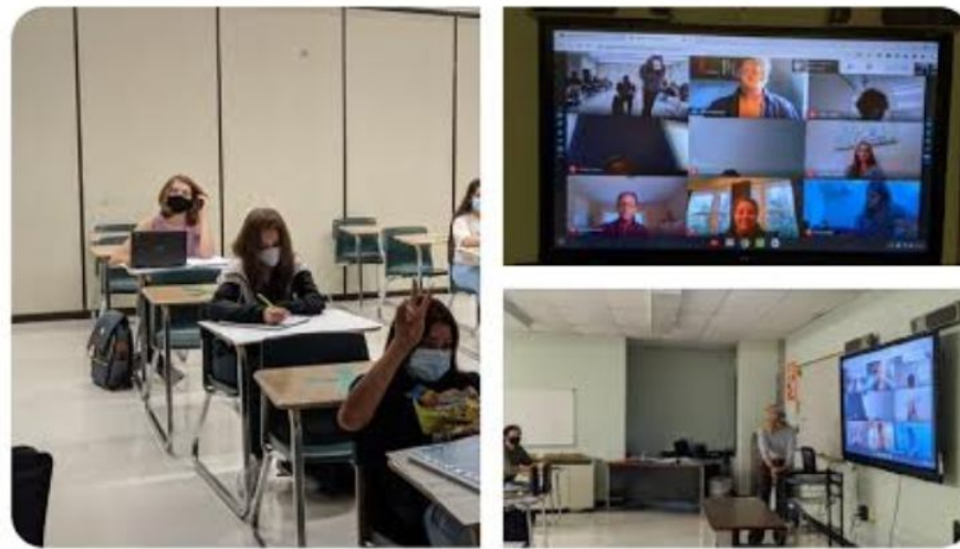
Above: At the high school, students learn the same lesson both remotely and in person.