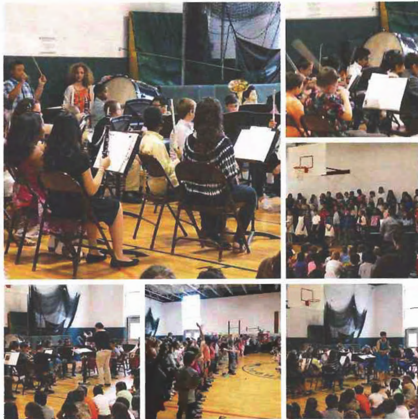
Above: Scenes from the Nassau In-School Concert.