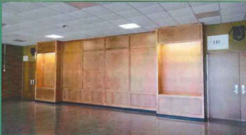
Above: Spackenkill High School is getting twin music trophy cases in the auditorium lobby.